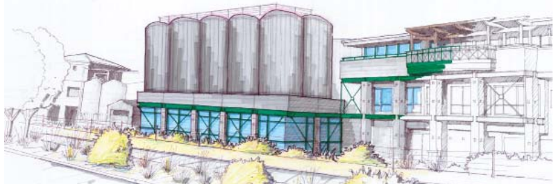
Rendering courtesy of BBT Architects

The fermentation tanks and tasting room are slated for completion in the end of January, 2012. This is the second project R&H has completed for Deschutes Brewing. The first was their Portland Brewery and Restaurant in the Pearl District.