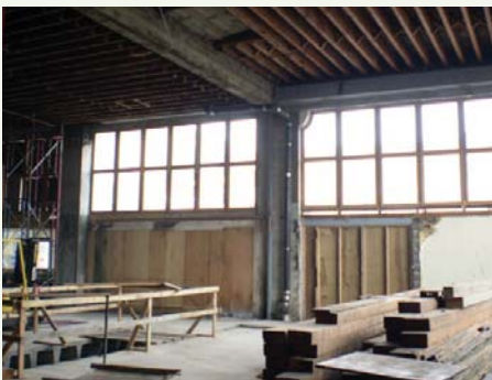
Second-story windows at Grand Central Building.

The former Grand Central Bowl Building in SE Portland is currently undergoing a complete historic renovation, bringing back the building's original 1920's charm.