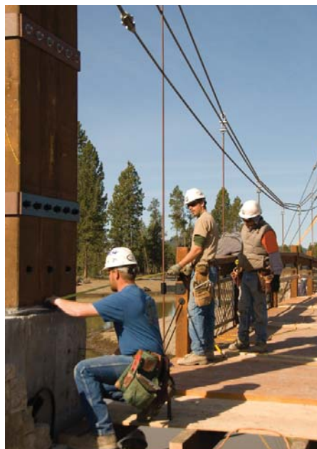
R&H workers attach cabling to the bridge at Caldera Springs.