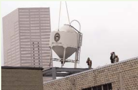
The grain silo was hoisted by crane to the roof of the pub.

Deschutes Brewing is bringing their successful, Bend-based restaurant and brewery to Portland this spring. R&H is currently wrapping up construction on the brewery's new location on NW 11th in the Pearl District.