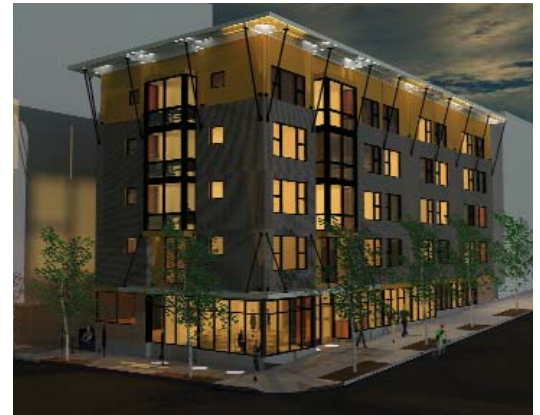
Rendering courtesy of William Wilson Architects

R&H is currently wrapping up construction on this 5-story, 20,000 s.f. wood-framed structure in downtown Portland. The development boasts 48-single room occupancy units for individuals in Multnomah County's Bridgeview program. This program assists those facing homelessness and mental health issues by providing safe housing and on-site support services. Bridgeview will occupy the first floor of the building along with a commercial kitchen, dining area, bicycle storage and meeting rooms. Working closely with the project architect, William Wilson, the building is on track to receive Earth Advantage certification.