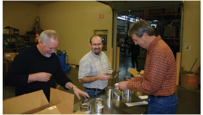
R&H team members box canned food at the Oregon Food Bank

Over the summer months, employees and their families collected school supplies to donate to Portland-based Schoolhouse Supplies, which helps teachers in disadvantaged schools "shop" for their students. To end the year, 25 of our team members volunteered at the Oregon Food Bank over the holiday season, assembling 17,675 meals for Oregonians in need.