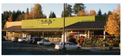
The flagship store, Raleigh Hills