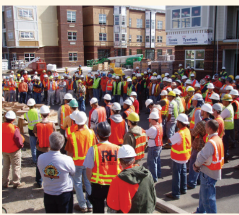
Team members gather for an onsite "Safety Break"